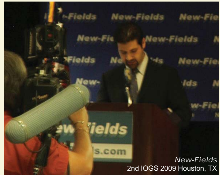
New-Fields 2nd IOGS 2009 Houston, TX

You will be able to network with Iraqi Kurdistan Oil & Gas Officials & Pre-schedule One-to-One discussions