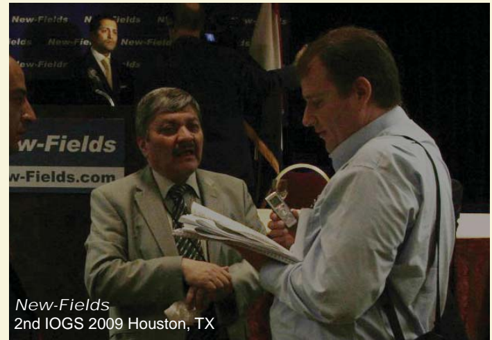
New-Fields 2nd IOGS 2009 Houston, TX

Dr. Ibrahim Al-Olom Former Minister of Oil